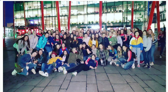
TYs pictured at the showing of Legally Blonde at the Bord Gais Energy Theatre.