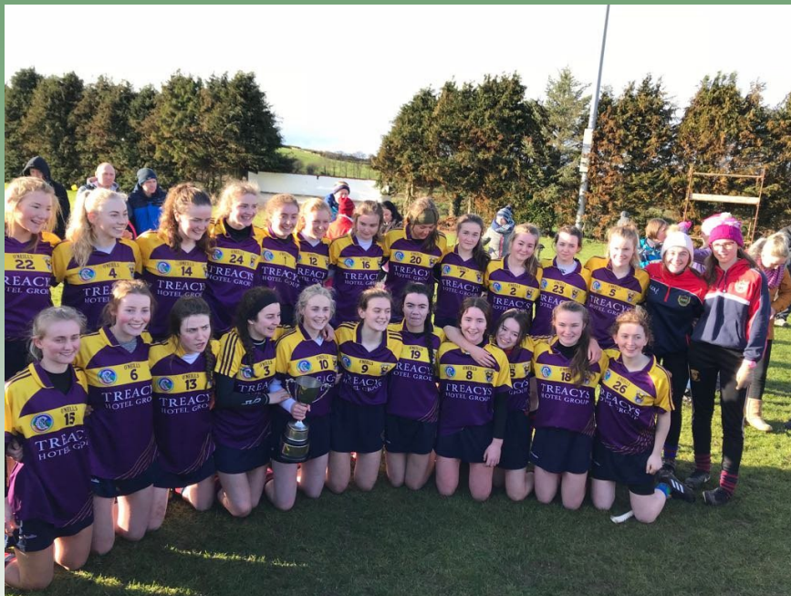
Our Leinster Senior 'B' Champions 2018

Congratulations to all of the players and mentors– the entire school community is very proud of you all.