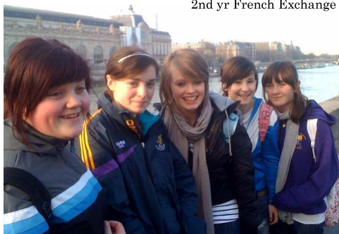
Students pictured on the banks of the Seine!