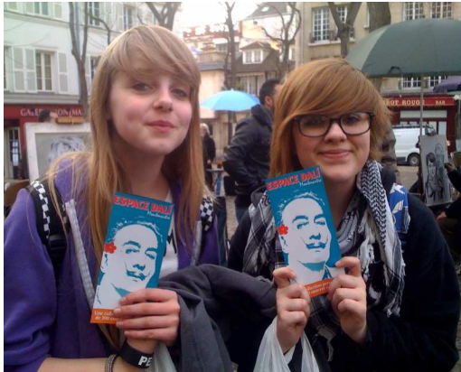
Place de Tertre