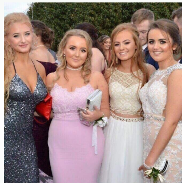
Glitz at Graduation