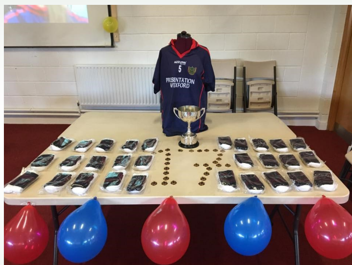
Winners: Presentation for Senior Camogie Champions