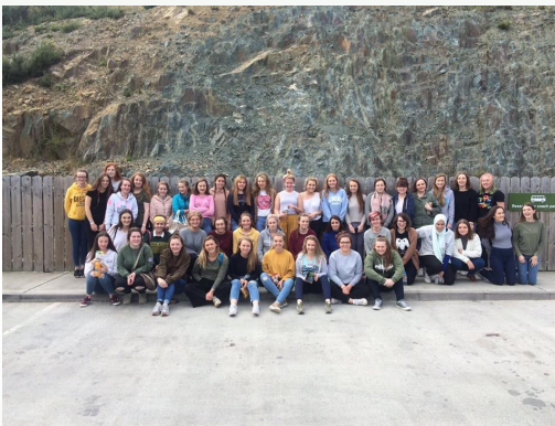
6th Years At Higher Options