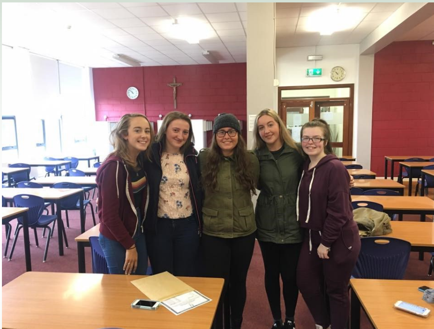
Excitement in August as students received their results.