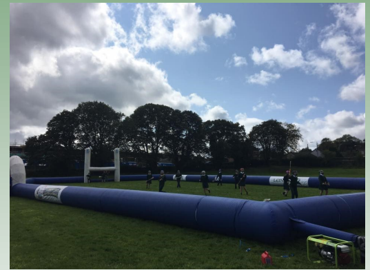
Leinster GAA Inflatable Pitch

Daltaí ón Séú Bliain ag baint sult is tairbhe as 'An Triail' i gCeatharlach inniu. Máire Ní Chathasaigh 'Ciontach nó Neamhchiontach?'