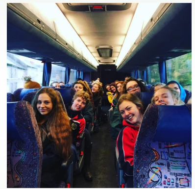
Ag Science Students en route to Teagasc Beef & Dairy Farm