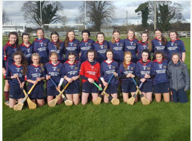
Junior Camogie Panel