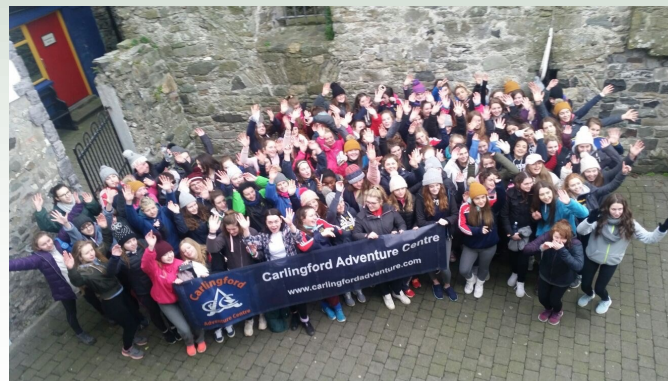
TYs in Carlingford