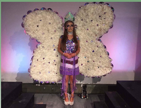
Well done to our Junk Kouture entry Miss Chrysalis