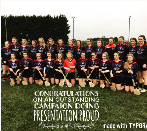
Senior Camogie Panel