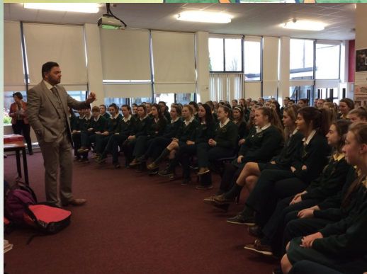
Meitheal Leaders on Presentation Day