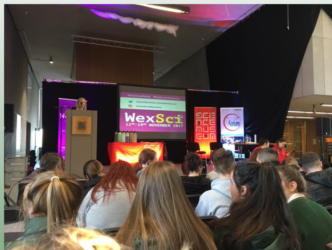
Our science TY students attending WexSci's exhibition of 'It's Got Guts' for science week.