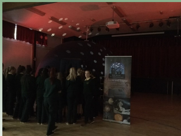
The following day first years escaped from Earth's gravity to plunge into outer space with the arrival of Big Bear Planetarium .