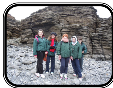
1A2 Field trip to Hook Head