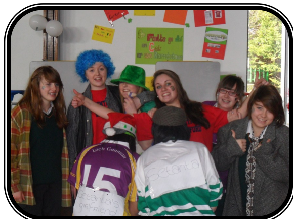
TY recent fundraising Céillí for Barrettstown